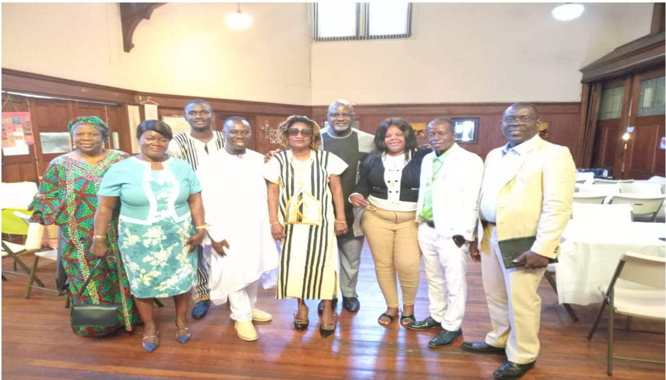
First Annual International Conference Oct 13 th -16 th , 2024 Attendees.